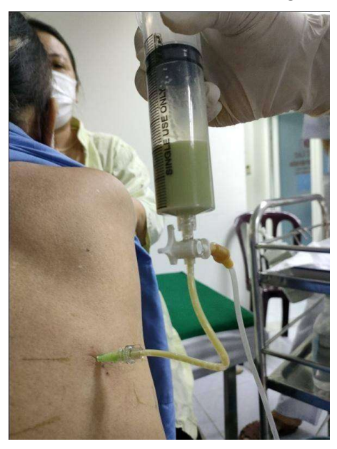
Figure 3. Color and nature of pleural fluid

Chest radiograph and CT showed that the inferior lobe of the right lung had a pleural loculated effusion with a size of 105x62 mm, along with an unevenly thick pleura (figures 1 and 2).