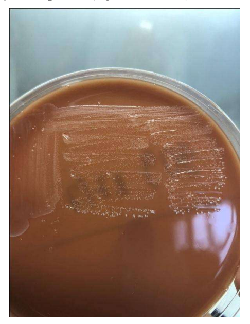
Figure 4. Bacterial colonies of S. intermedius isolated on Chocolate agar

Right pleural aspiration released the fluid with match a green color and a volume of 250ml (figure 3). The bacterial culture result displayed pure Gram - positive cocci (figure 4).